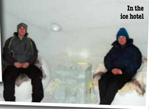
In the ice hotel

buffet service cruise we'd just come off... We were about to spend the night in a snow hotel! Strolling through the doors, we were welcomed with a crowberry shot, known as Rudolf's Revenge!