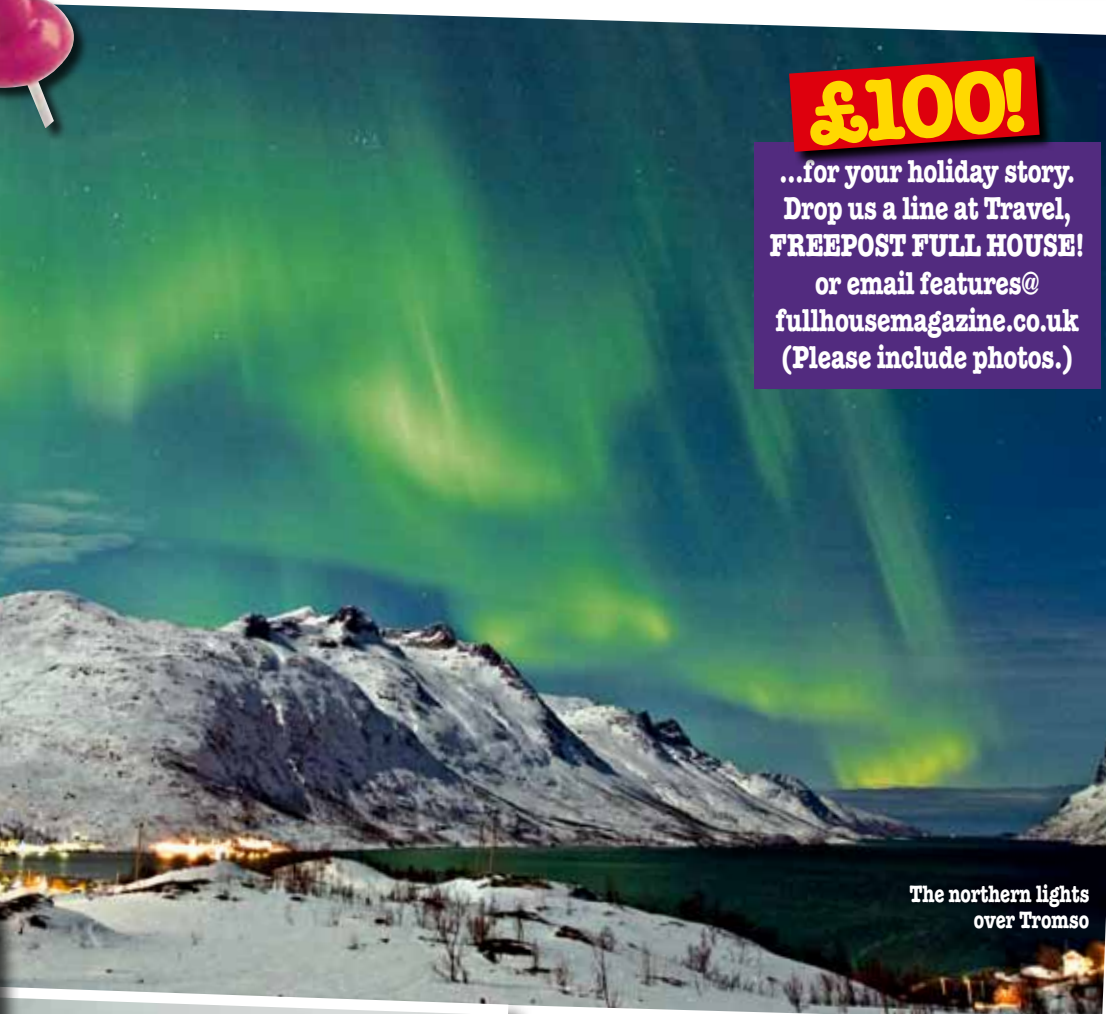
The northern lights over Tromsø