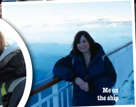
Me on the ship