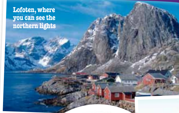
Lofoten, where you can see the northern lights

Two days earlier we'd flown into Tromso – the largest city in northern Norway. No one could have expected the welcome we'd got as we headed towards the city, though. Just before landing, the pilot's voice had come over the tannoy.